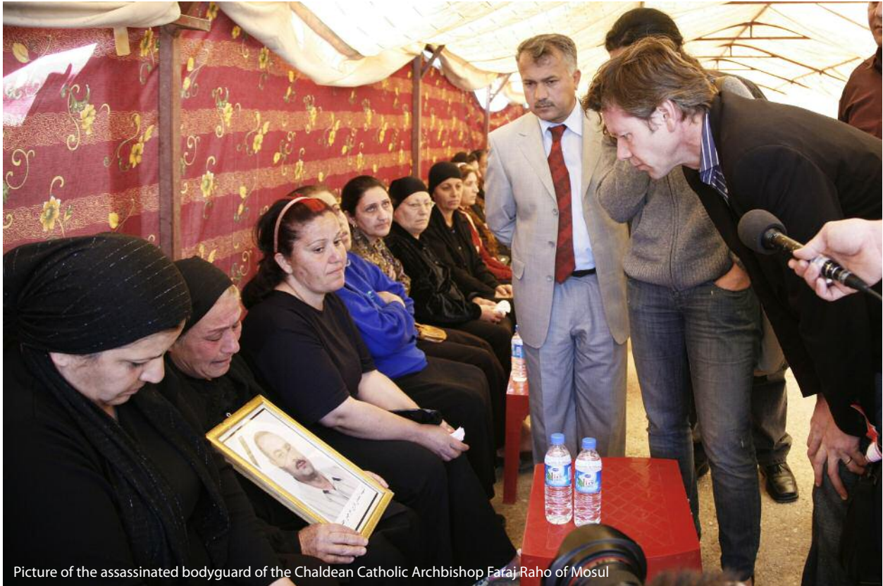
Picture of the assassinated bodyguard of the Chaldean Catholic Archbishop Faraj Raho of Mosul