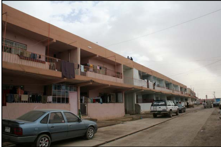
The apartment complex in Qaraqosh known as the “Aghajan apartments”.

A large complex of 350 apartments in Qaraqosh are known as the “Aghajan apartments”. The locals claim the place was built with money provided by KRG finance minister Sargis Aghajan. The maintenance and general administration of the apartments is run by a council attached to the church in Qaraqosh. The Observation Mission heard from different sources that the tenants, mainly poor people and Internally Displaced Persons (IDPs), had been forced and/or encouraged to vote for the Ishtar slate by economic means. Locals claimed the people in the apartments were promised lower rents if they vote for Ishtar.