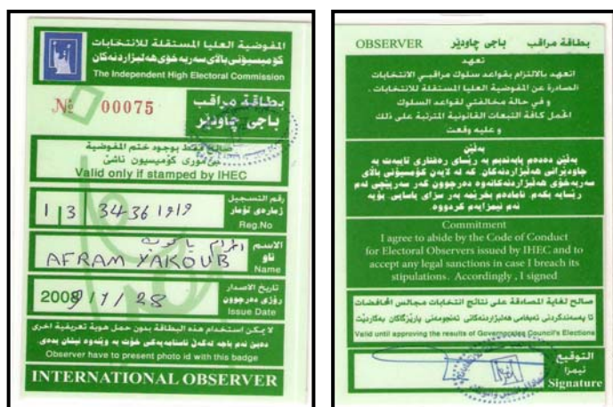
The front and back side of the international observer badge the militia men did not want to recognize.