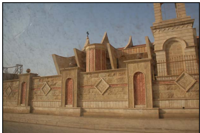
The church in central Qaraqosh.

“After speaking to the two families, the charity member and the militia man I received a tip of two other families in the apartment complex who had something to tell. I received the tip from a local with good knowledge about the people in town. As we were driving back to the apartment complex we faced several new guards at the entrance of the complex, now equipped with walkie talkies. I felt they had been waiting to meet us. The guards insisted one of them follows us inside the apartment complex. One of them stepped into our car with his Kalashnikov. I immediately aborted the mission saying that we should visit the old town first. We asked the guard to step outside and asked for directions to the old town to make the situation look credible. We then drove away from the apartment complex. It wouldn’t be a good idea to show up at the family’s house with one of the militia members. ”