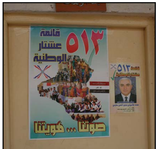
A poster for the Ishtar slate.