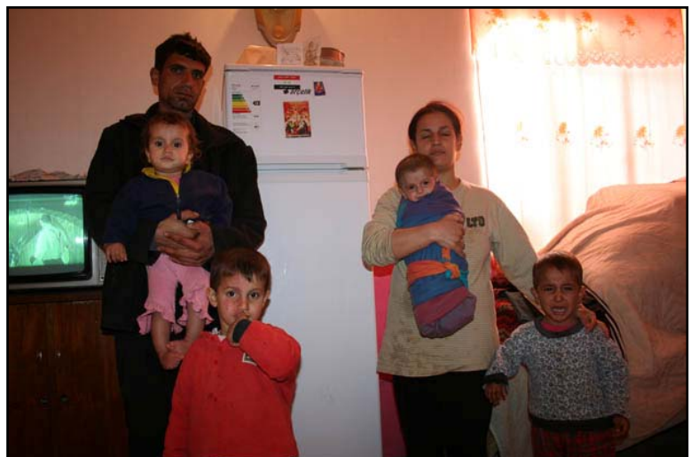
The family standing around the new refrigerator.